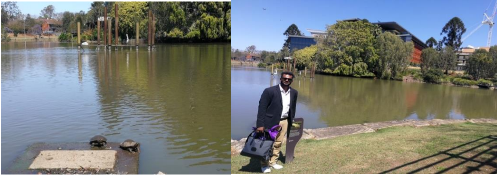
The tour of University of Queensland, St Lucia, Queensland, Brisbane.